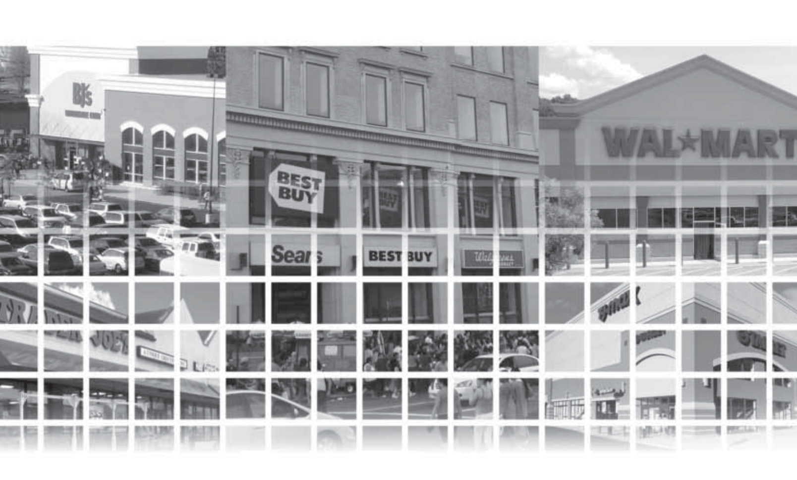
Focused. Disciplined. Value-Driven.